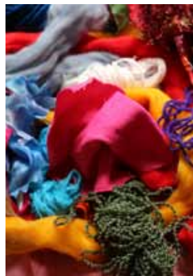
Tinker with all sorts of exciting materials to create squishy sculptures

Dates: Wednesday 18 January and Thursday 19 January