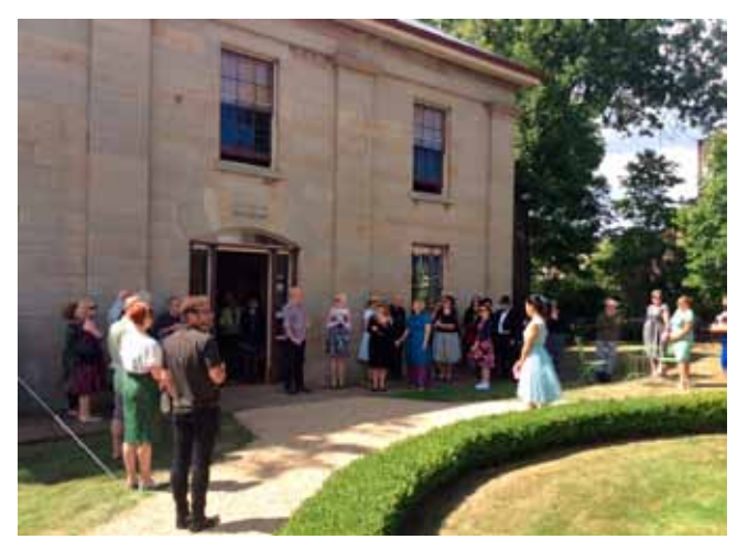
Vintage Valentine's Garden Party at Narryna, February 2016