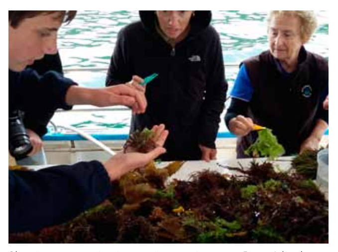
Showing young scientists marine specimens on Bruny Island as part of the TeachLive program