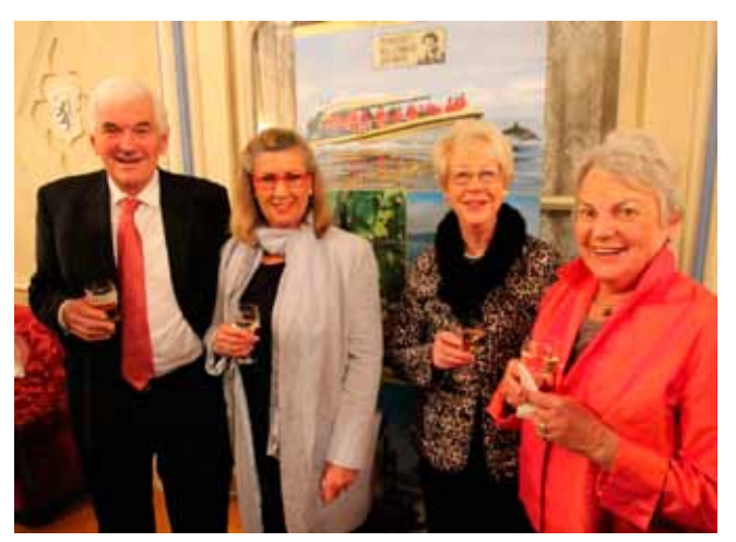
Foundation event at Government House, May 2016