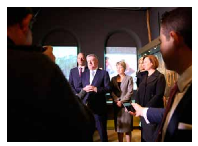
kanalaritja: An Unbroken String funding announcement, May 2016

TMAG had another successful year in research and public programming grants, the highlight being awarded $427 875 for the presentation and national tour over three years of kanalaritja : An Unbroken String from the Federal Government's Visions of Australia program. Other significant contributions were received from the Federal Government's Tourism Demand Driver Infrastructure Program, Hobart City Council, Director of National Parks, ABRS, Arts Tasmania, Council of Heads of Australian Herbaria, Council of Heads of Australian Faunal Collections, Tasmanian Heritage Council, Tasmanian Association for Hospice and Palliative Care Inc, and the Gordon Darling Foundation.