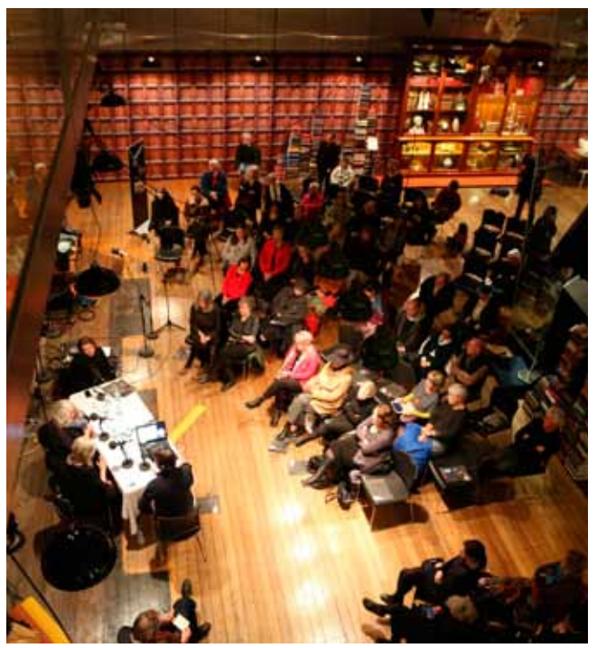
Radio National Books and Arts Daily live broadcast in the Central Gallery during Dark Mofo, June 2016