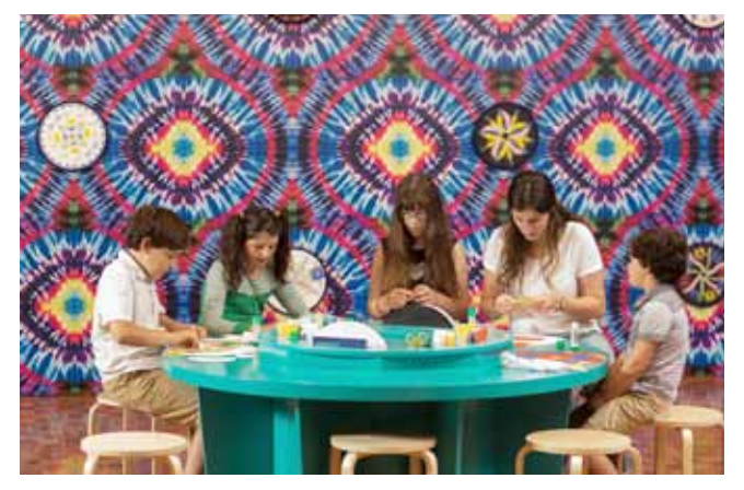
Visitors enjoying the Pattern Play exhibition, December 2015