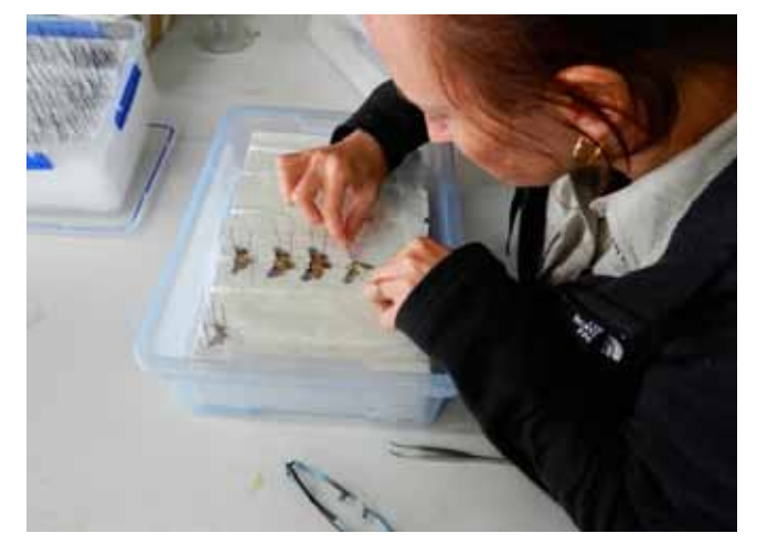
Teaching young scientists how to pin insects on Bruny Island as part of Earthwatch's TeachLive program

Annual audits and reports assessing the environmental, storage capacity, data integrity and valuations were completed. These data contributed to the TMAG Strategic Asset Management Plan and the Strategic Plan. A complete audit of the works on paper collection