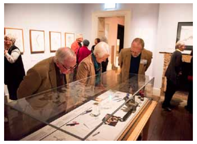
Friends' members enjoying the Where Science Meets Art exhibition