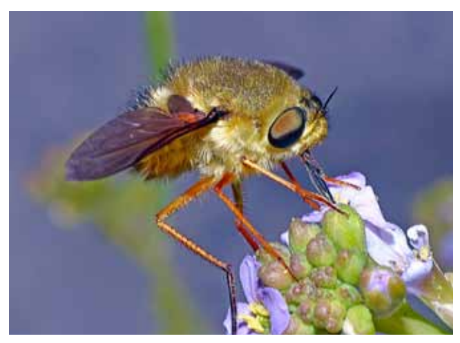
A golden beefly, featured on the popular Fauna of Tasmania app

The section continues to provide advice and expertise to members of the public, other institutions and government agencies, most notably assisting the Maritime Museum of Tasmania, the Allport Museum committee, the Australian Institute for the Conservation of Cultural Material, as well as participating in the review of the Protection of Moveable Cultural Heritage Act 1986.