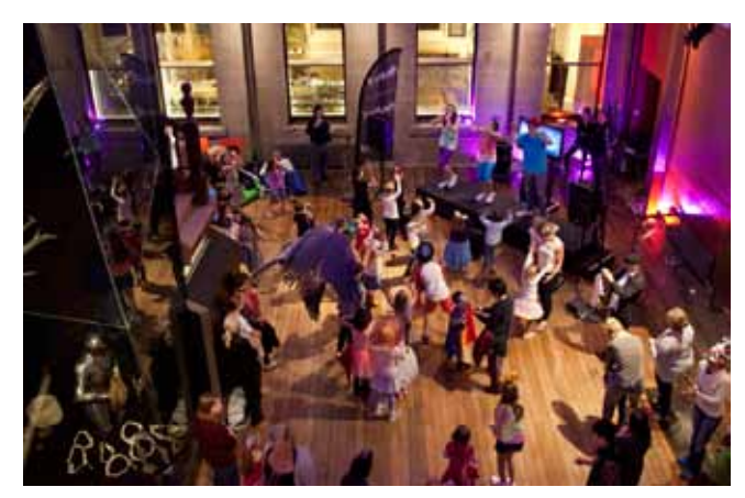
TMAG Children's Festival late night Masquerade Disco, April 2016

TMAG's World War I exhibition The Suspense is Awful: Tasmania and the Great War continued until 28 February 2016, and was accompanied by a range