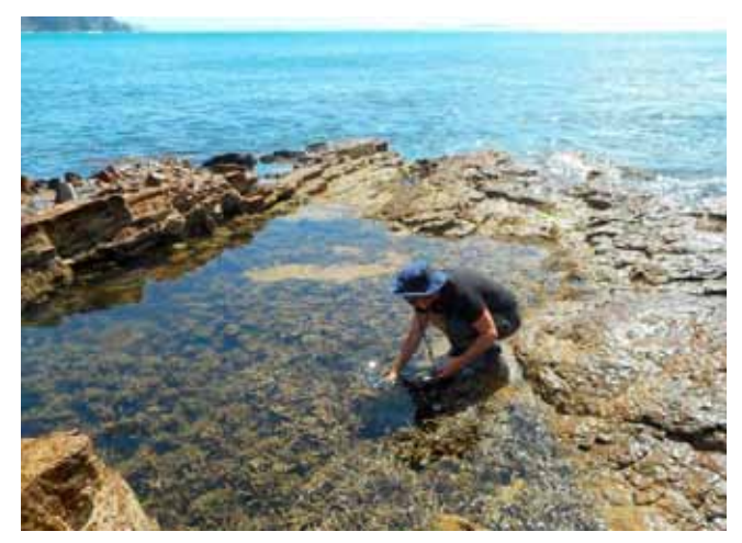
Collecting specimens during the Bruny Island Bush Blitz

Zoology staff completed Bush Blitz expeditions in the South West and Bruny Island. Preliminary results suggest one new species of land snail and at least 150 undescribed species of moths were discovered. The rare moss froglet ( Crinia nimba ) was recorded at several locations in the South West creating a large range extension for this elusive amphibian. Over 100