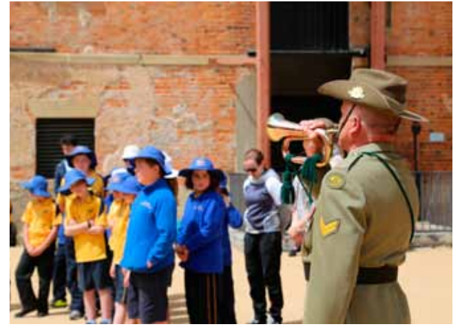
Remembrance Day ceremony in the TMAG Courtyard, 11 November 2015