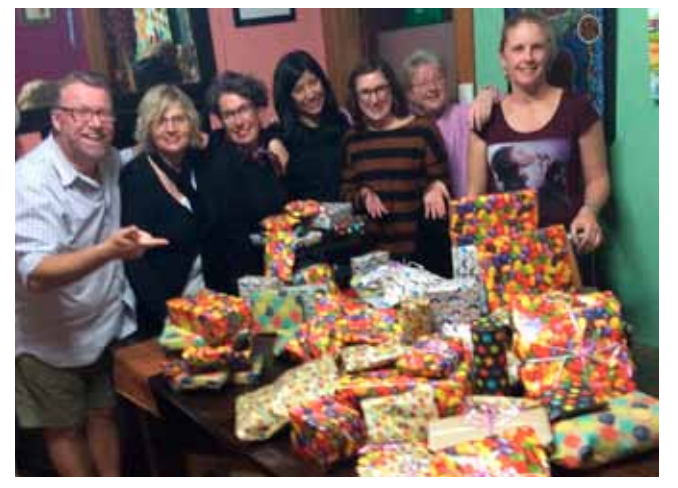
TMAGgots Quiz Night preparation, May 2016