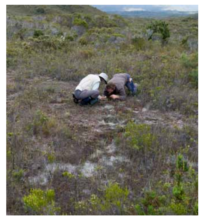
The Tasmanian Herbarium's Lyn Cave and Matt Baker collecting extremely rare Ambuchanania sporophytes

Together with TMAG Zoologists, Herbarium staff participated in the 2016 Tasmanian Bush Blitz expeditions to Tasmania's remote South West wilderness and Bruny Island under the national Bush Blitz program, Australia's flagship species-discovery project, funded jointly by the Commonwealth Government and BHP Billiton. For the first time in Bush Blitz history, the collection of marine organisms, including macroalgae, molluscs, corals and other marine invertebrates, was conducted at various