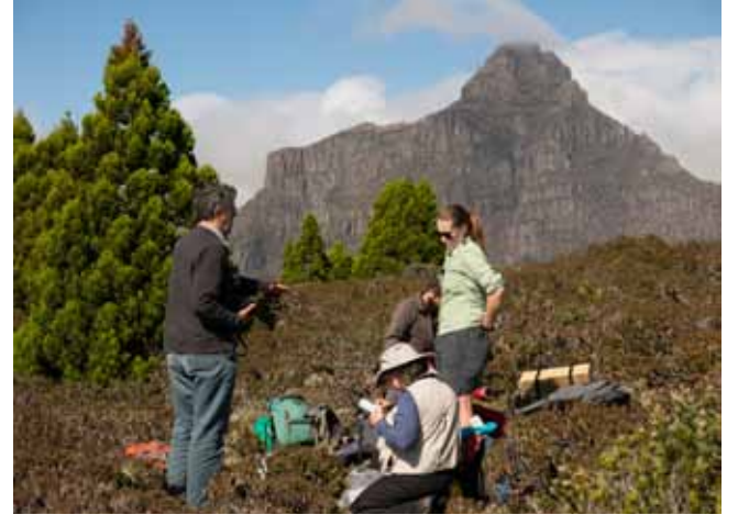
Tasmanian Herbarium staff at Mount Anne during the South-West Tasmania Bush Blitz, February 2016