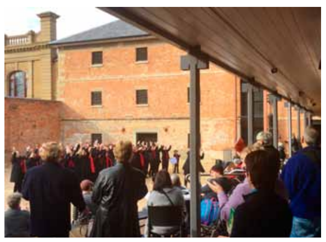
Festival of Voices pop-up choir in the TMAG Courtyard, July 2015

TMAG hosted a special public event on the opening night of Dark Mofo 2016 featuring music, lights, food and entertainment which attracted nearly 4000 visitors. TMAG's event complemented the activities on offer in Dark Park at Macquarie Point, ensuring that the waterfront precinct was the focus for community involvement. To coincide with the opening of the migrant exhibition, Snapshot Photography , TMAG hosted another late night opening on Friday 18 March 2016 to celebrate the launch of Harmony Week in Tasmania.