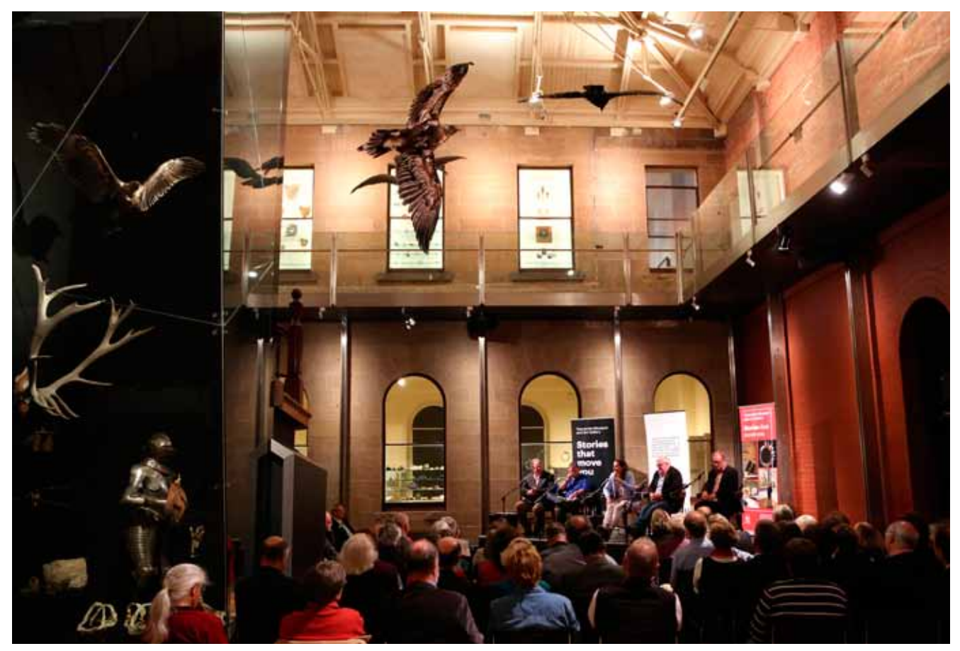
The War and Memory Forum, held in conjunction with the exhibition The Suspense is Awful: Tasmania and the Great War, on Remembrance Day, 11 November 2015, in the Central Gallery