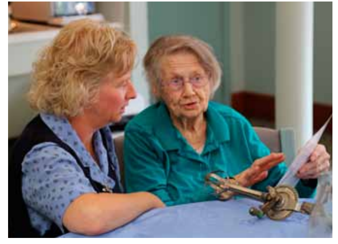
The iRemember In the kitchen Memory Case in use

An important partnership between TMAG and the University of Tasmania's Wicking Dementia Research and Education Centre resulted in a new loan resource, the iRemember In The Kitchen Memory Case, which was launched at the museum during Dementia Awareness Month. The free loan resource aims to assist people living with dementia and their friends, families, partners and carers to communicate more easily and enjoyably with each other. The case was developed after extensive research by the Wicking Dementia Research and Education Centre and by staff at TMAG, with 30 people living with early and middle stage dementia and their carers surveyed to explore what objects they would like included. Due to the success of the In The Kitchen case, funding was also secured during the year to produce a second case, titled In The Shed.