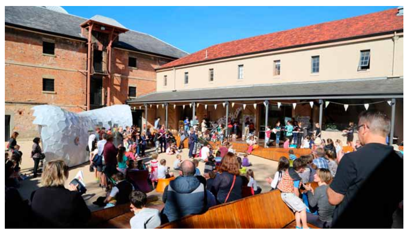
TMAG Children's Festival Launch, April 2016

TMAG enriches, inspires and educates local and global communities by connecting them with Tasmania's unique journey and place in the world