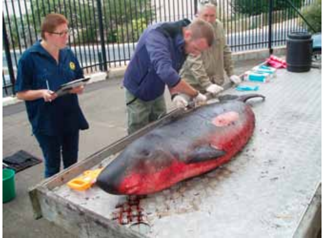
TMAG's Vertebrate Zoology staff assisting with a necropsy on a pygmy sperm whale that stranded in North-East Tasmania

Finally, over 770 000 zoology records were downloaded from 3 587 visits to the ALA during the year.