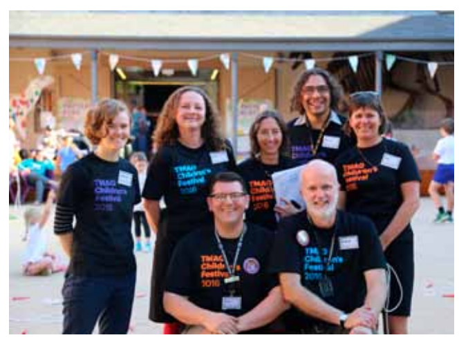
The Centre for Learning and Discovery team during the TMAG Children's Festival, April 2016

Panel members provided advice and input into the program of the inaugural TMAG Children's Festival, held in April 2016, and also hosted the festival launch. During the festival TMAG also launched its Kids in Museums Manifesto, which outlines the museum's commitment to ensuring visitors have a family friendly experience. It was developed with input from panel members, as well as advice from the Commissioner for Children, Tasmania, and the Commissioner's Children and Young People's Advisory Council.