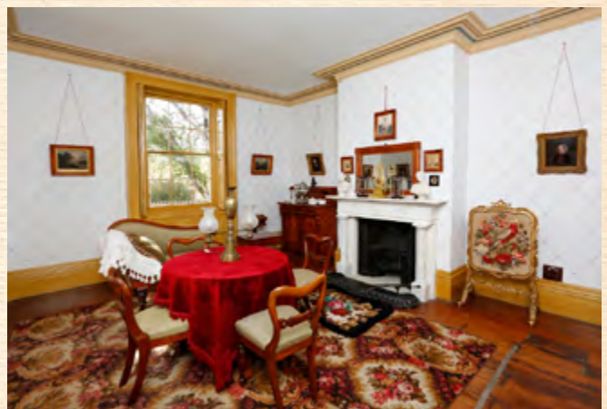
The restored Narryna drawing room.