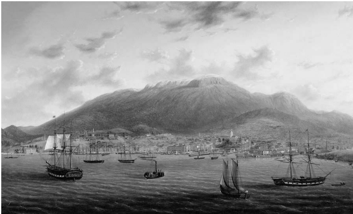
AG475 Henry Gritten [artist] 'Hobart Town' 1856, oil on canvas, image : 94 x 153.2, Collection: Tasmanian Museum & Art Gallery, Purchased 1961

The new structure encourages the development of partnerships and collaborative projects between the various participating organisations.