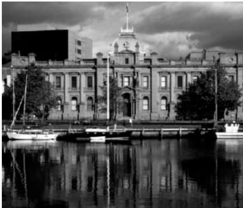
Top left: Q1995.129.36 Tasmanian Museum & Art Gallery showing detail of stone carvings on Customs House Top right: Q1995.129 Macquarie Street entrance, Tasmanian Museum & Art Gallery Above: Q1996.107 Tasmanian Museum & Art Gallery, Customs House Building in Davey Street with Constitution Dock in foreground