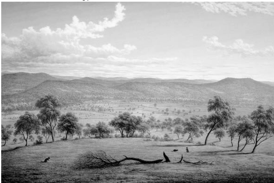
AG3 John Glover [Artist] 'Mills Plains' 1836, oil on linen canvas, image: 76.2 x 152.5 cm, Collection: Tasmanian Museum and Art Gallery, Presented by the George Adams Estate 1935

The Curator made the following presentations: