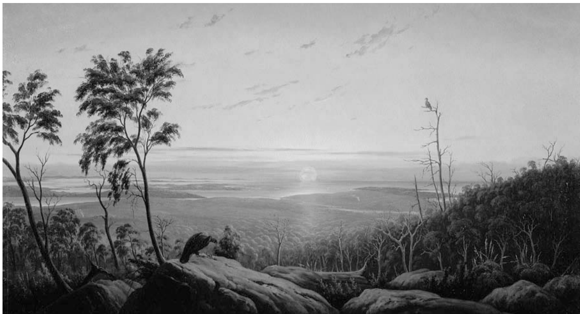
AG107 Knut Bull [Artist] 'Entrance to the River Derwent from the Springs, Mount Wellington' 1856, oil on canvas, image: 75.5 x 132; Collection: Tasmanian Museum & Art Gallery, Presented by Miss Ada Wilson 1907