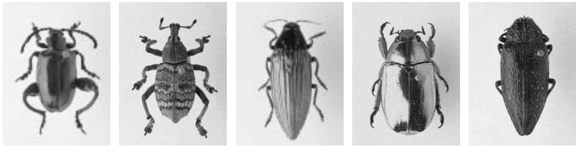
Beetles from the George Bornemissza Beetle Collection