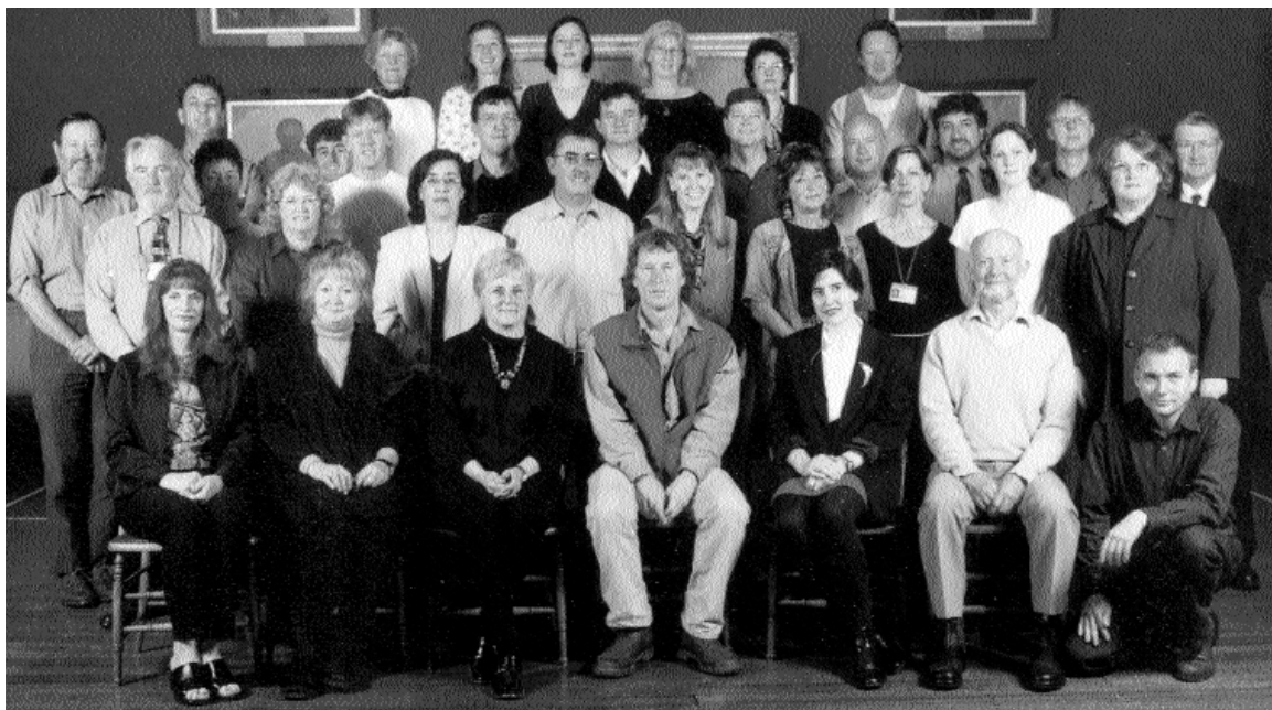
Q2000.91.1 Staff photographs taken in the Colonial Gallery at the Tasmanian Museum and Art Gallery, November 2000