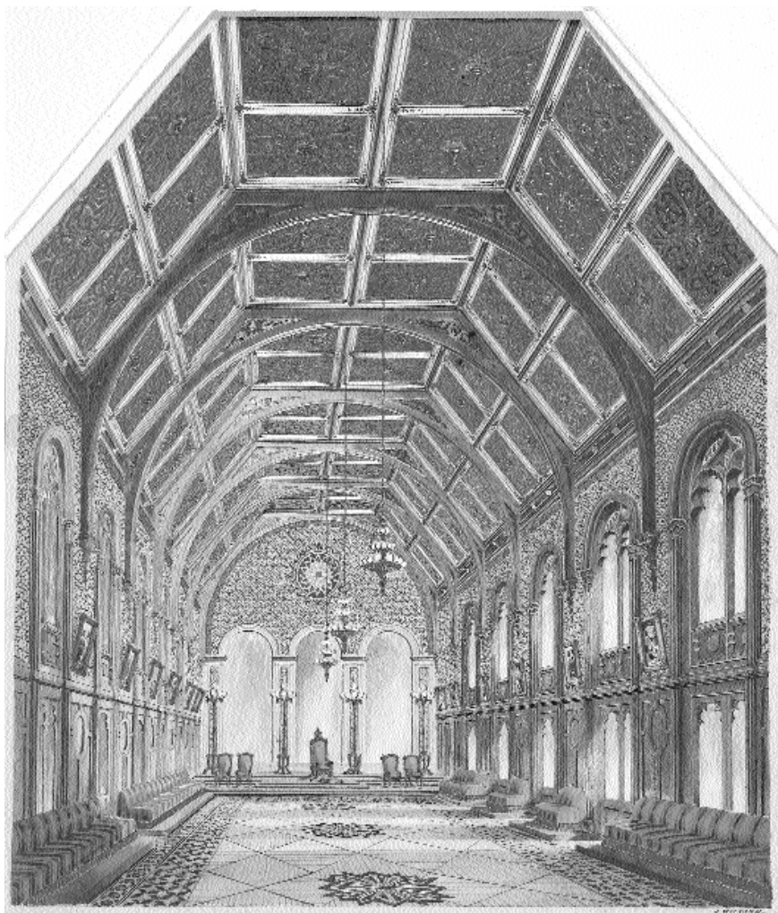
AG5189 John Henry Willson [artist] 'Ballroom, Government House' 1856; Drawing watercolour/gouache, image: 32.2 x 27.6 cm, Collection: Tasmanian Museum and Art Gallery, Purchased with funds from the Art Foundation 1988

The Art Department also continues to maintain a loan program of art work to the Premier's Office, Minister's Offices, Government House and the Hobart City Council.