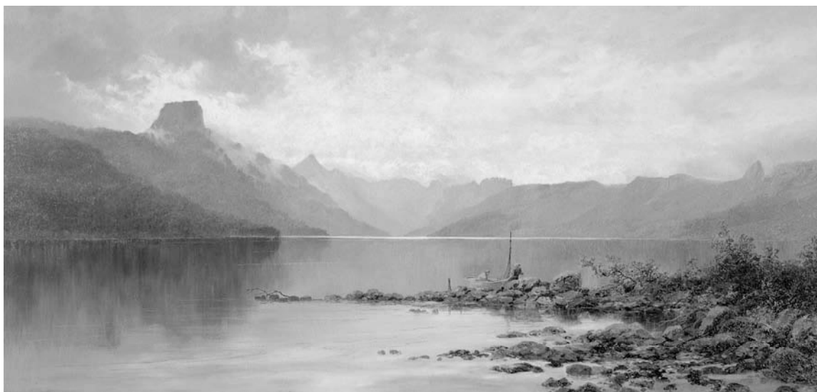
AG115 W C Pigenit [Artist] ' Lake St Clair, the Source of the River Derwent, Tasmania ' 1887, oil on linen canvas, image: 53.7 x 113cm, Collection: Tasmanian Museum and Art Gallery, Presented by W C Pigenit to the Tasmanian Government and transferred to the Art Gallery 1889

TMAG has continued to support a wide range of community groups and organisations by providing a venue for various displays, functions and events.