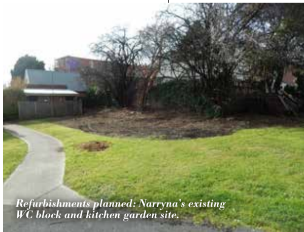
Refurbishments planned: Narryna's existing WC block and kitchen garden site.